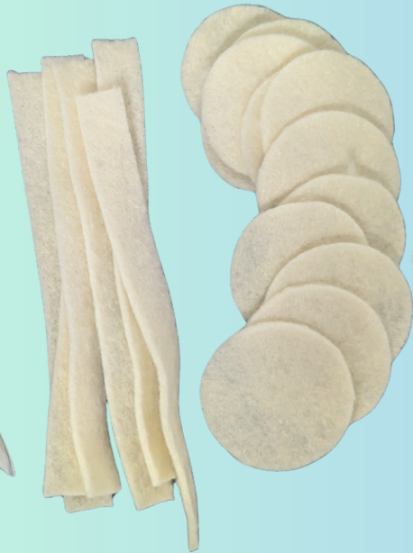
Thread 3 Sewing Needles