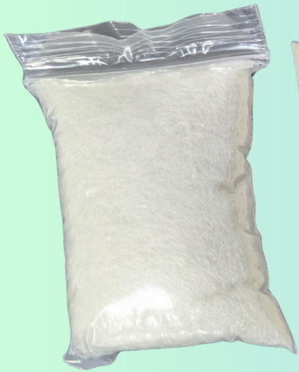
6 Banana Slices Stuffing