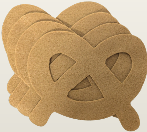
2 Pretzels Stuffing